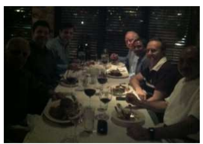
Volunteer committee celebrating at Vito's Chophouse after a very successful symposium