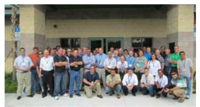
Group shot from the tour of the Southern Regional Water Supply Facility – with our hosts Orange County Utilities.