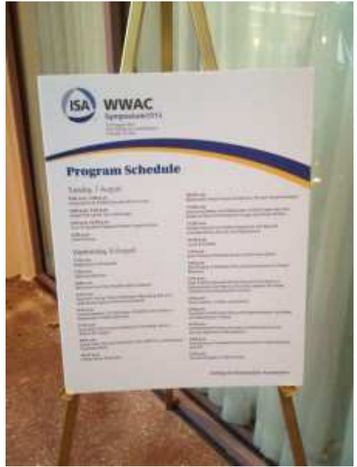
First Day of the symposium technical program