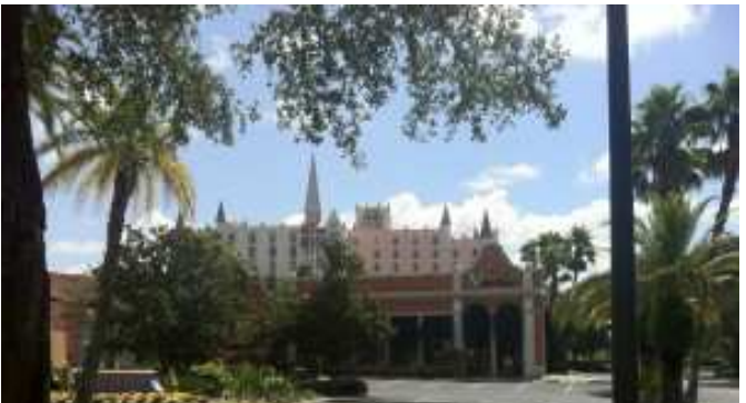
Our symposium hotel - Holiday Inn "Castle" hotel