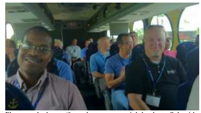
Photo on the bus to/from the tour – special thanks to Schneider Electric for providing the bus transportation to/from the plant.